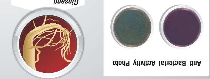
Nano Photo Copper Zinc Filter

Nano Silver Ginseng Filter consisting of anti bacteria filter & ginseng filter removes odour, deactivates bacteria, fungus & mould.